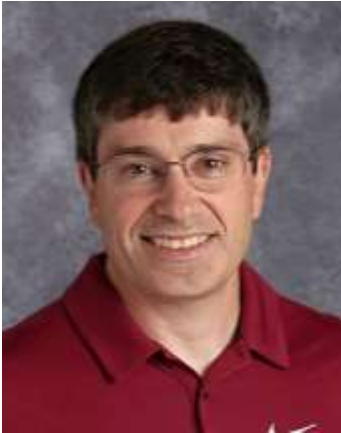
Calvin Gunn Elementary 17 Years 2002-present