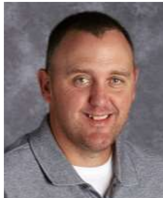
Scott Kramer Elementary 20+ Years 1997-Present