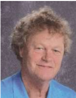
Richard James Elementary 23 Years 1995-2018