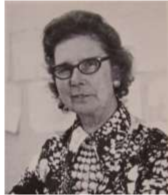
Evelyn Buehner Elementary 26 Years 1955-1981