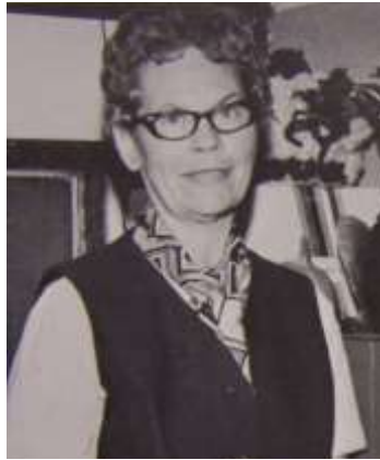
Opal Weiers Elementary 24 Years 1955-1979