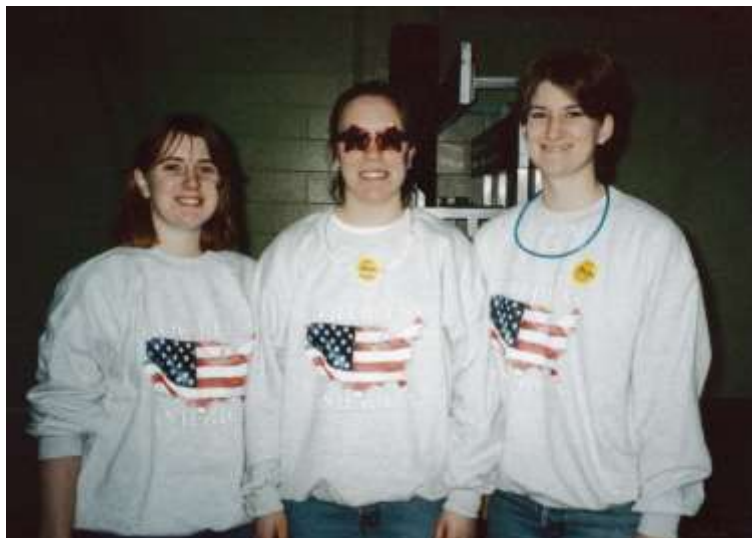
2001-2002 “American Tribute”