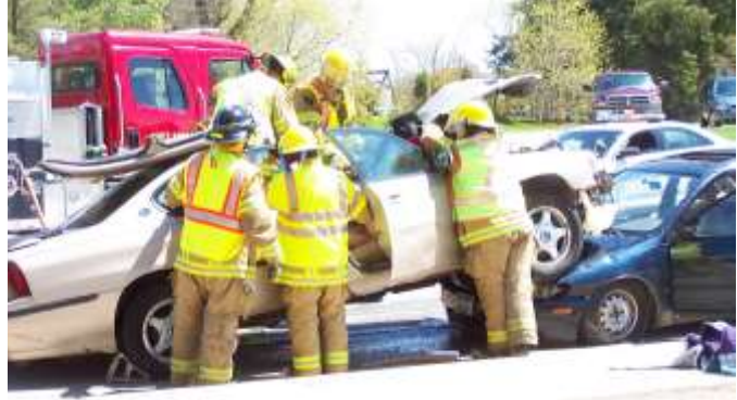
Bottom Right: Autumn Pendegayosh through the windshield