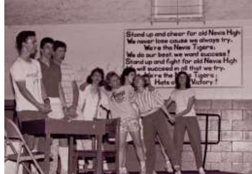
1987 Original Gym School Song

Stand up and fight for our (old) Nevis High We will succeed in all that we try. We’re the Nevis Tigers; Hats off to Victory!