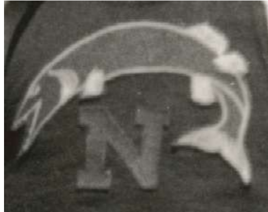
Tiger Muskie mascot displayed on the front of a basketball uniform