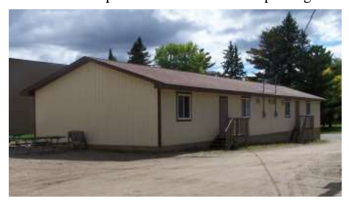
2002 Temporary Classrooms Built

and the classrooms would be in place while the permanent classrooms were under construction. Because the buildings became more permanent after the continued failure of the referendum, fire walls needed to be constructed between the temporaries and the main building and sprinklers were installed.