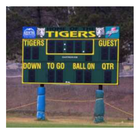
New Football Scoreboard

• A 10-year vending contract with NEI bottling was signed. They will provide new football, softball and baseball scoreboards in exchange for the contract. The Aquafina, Gatorade, and Propel products were advertised on the scoreboards rather than soft drink products. At least 75% of the beverage product was required to be noncarbonated. $1 "Marketing Fun" money was to be designated to the Student Council.