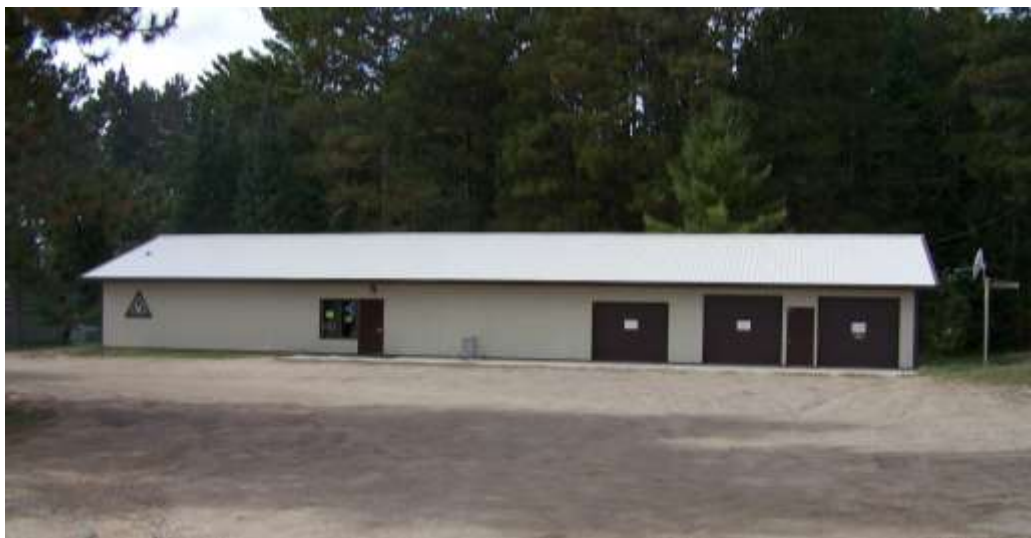
2004 Fitness Center and Small Vehicle Garage