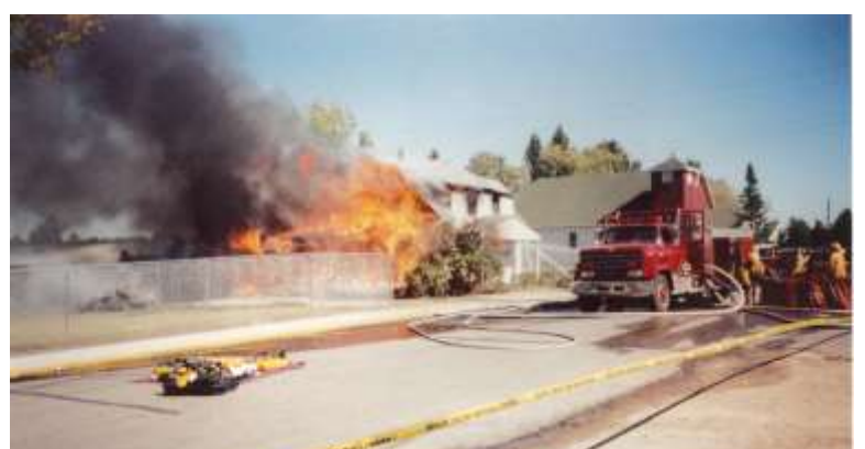
Lucas house being burned by the fire department.