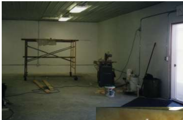
Sheet rocking the walls and installing electrical wiring in the Fitness Center.