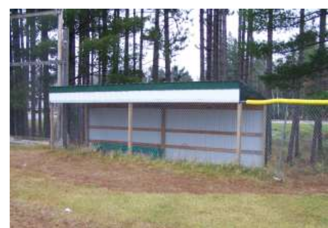
2008 Junior High Dugouts

approved as an extra-curricular activity at the school, at no cost to the District.