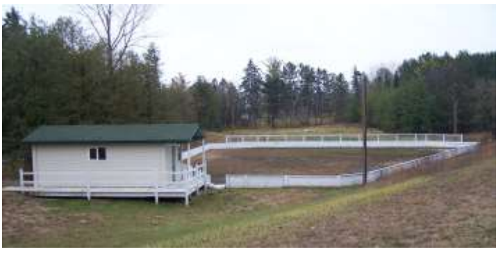
2008 Nevis City Skating Rink the senior class helped prepare and paint.

school board meeting at a cost of $17,600 with an additional $2,000 upgrade to an 8-light system rather than 6-light system over the bleachers. The lights were installed on December 10 and 11, 2008.