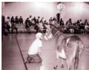
Pleading with Donkey during Donkey Basketball