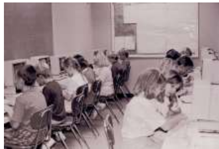
New Elementary Computer Lab