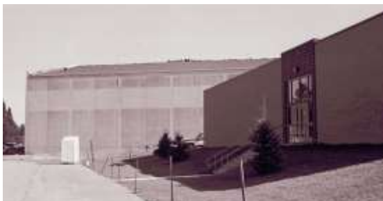
West end of High School Hall and Tiger Arena