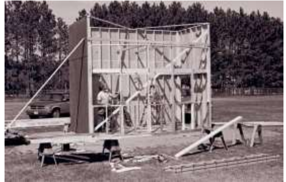
Concession Stand being built.