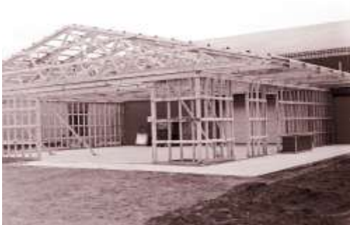
Janitorial Storage being Built