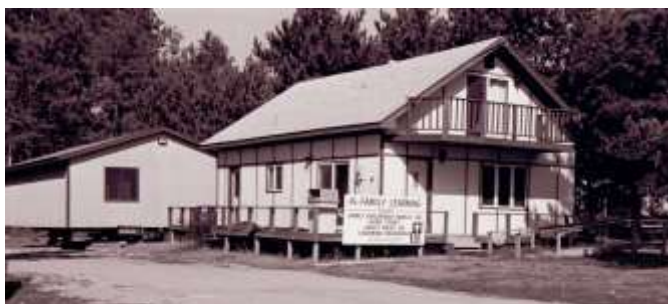
Hartlyn Hanson house (ECFE) with new addition to the left.