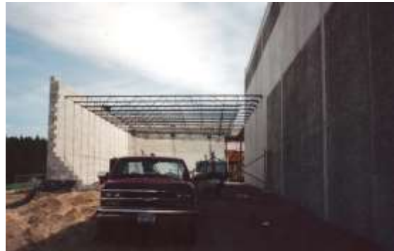
Band room addition on the north side of Tiger Arena.