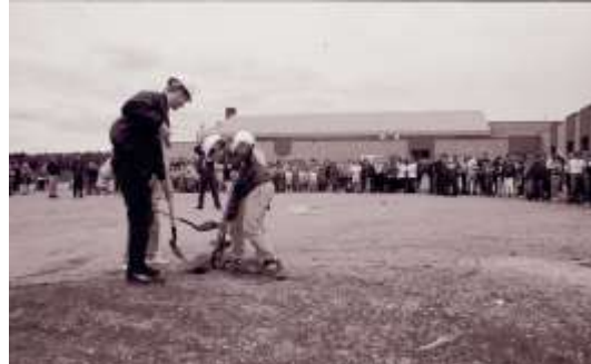
Groundbreaking Ceremony for Tiger Arena.