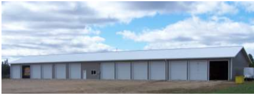
School Bus Garage