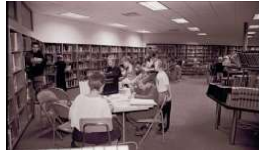
1994 Library Addition