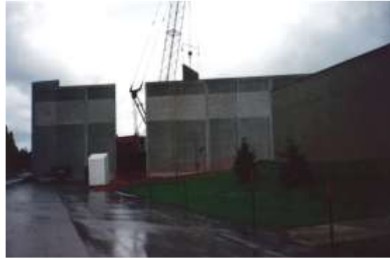
Tiger Arena walls being put together. The walls were brought in on semi-trucks and set by cranes.