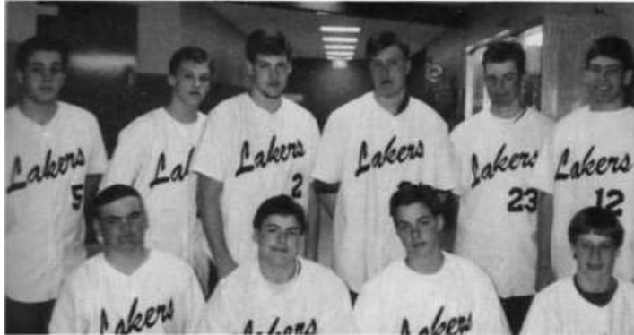
1993-1994 Baseball Team – 5 th year in WHA coop with team name Lakers