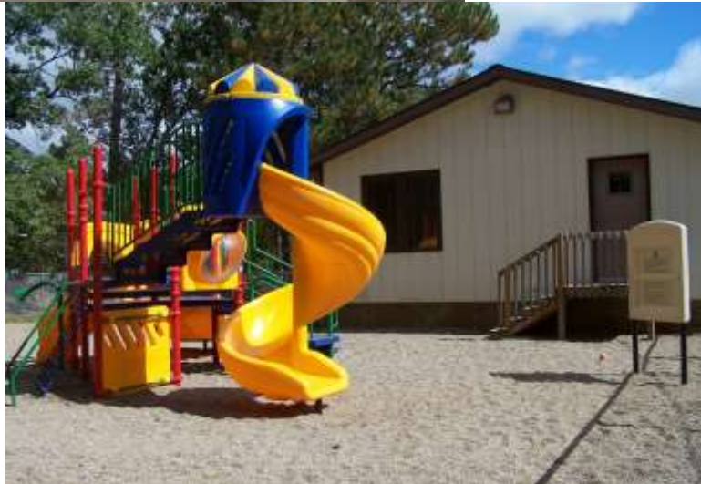
Early Childhood playground equipment.