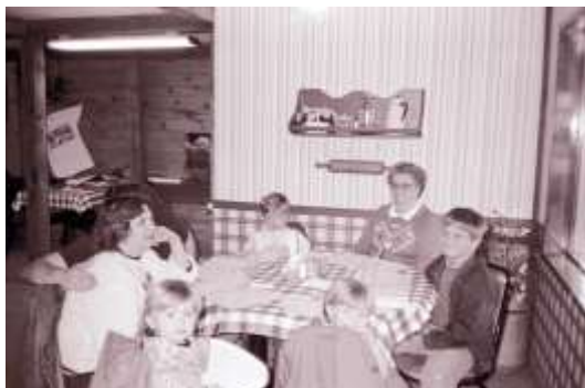
Seating in Tigerelli's

September and was three years in the making. The business was open Tuesday through Friday 3-9 p.m. and Saturday 12-9 p.m. The shop class helped repair the building, the art class designed