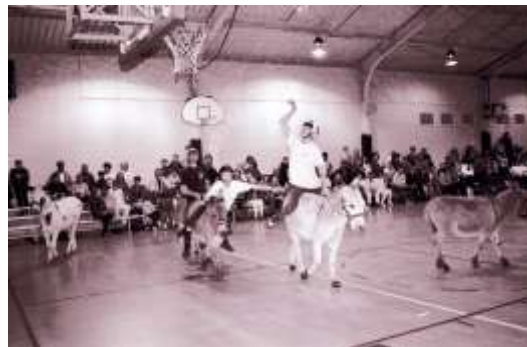
Donkey Basketball in the Original Gym