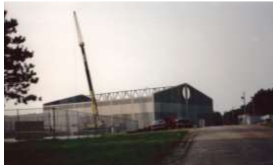
Tiger Arena without a roof.