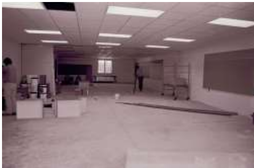
New elementary classrooms, currently 5 th grade classrooms, rooms 126 and 127.