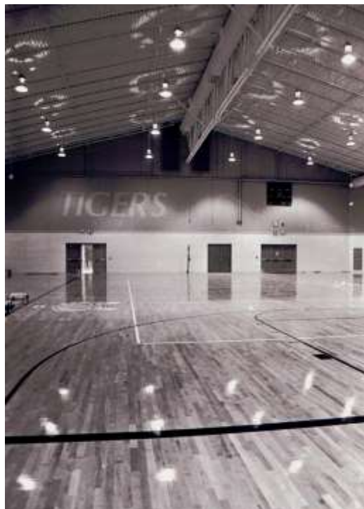
Tiger Arena Floor