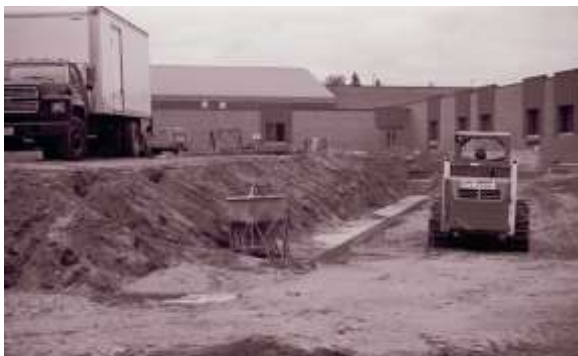
Dirt work being done for Tiger Arena