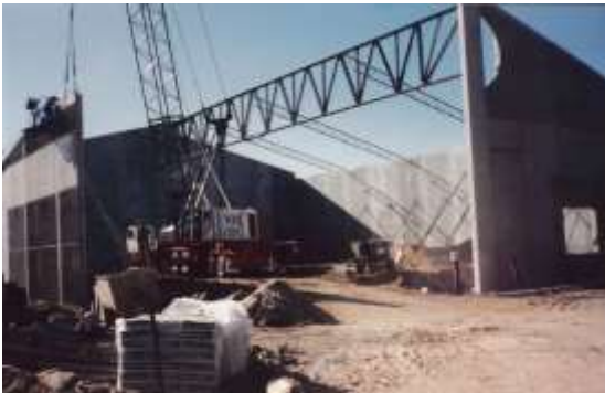
Tiger Arena ceiling center support beam being lifted into place.