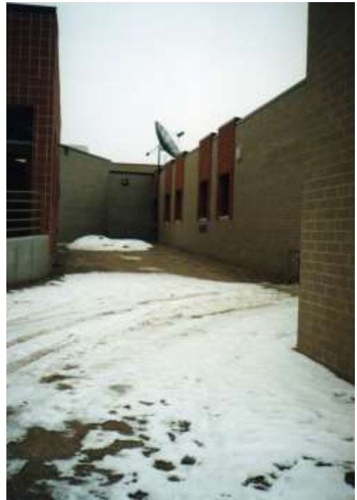
Science classroom was built in the dirt pile between the 1987 and 1994 addition.