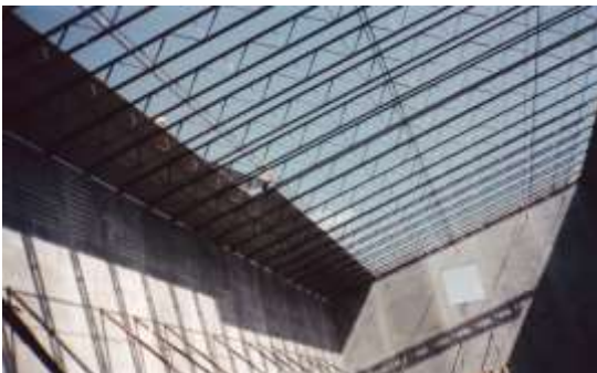
Tiger Arena roof being installed.