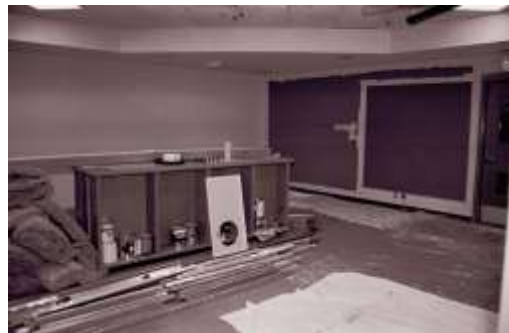
1987 Library being remodeled into two classrooms, rooms 119 and 193.