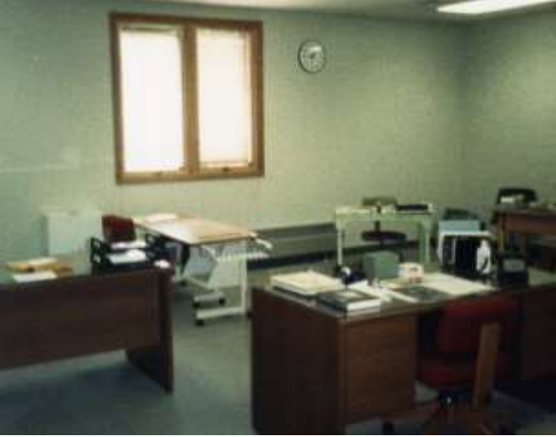
Above Left: Science room, currently room 168.