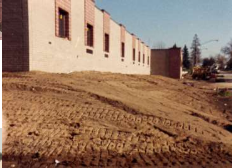
Finished dirt work in front of the high school wing.