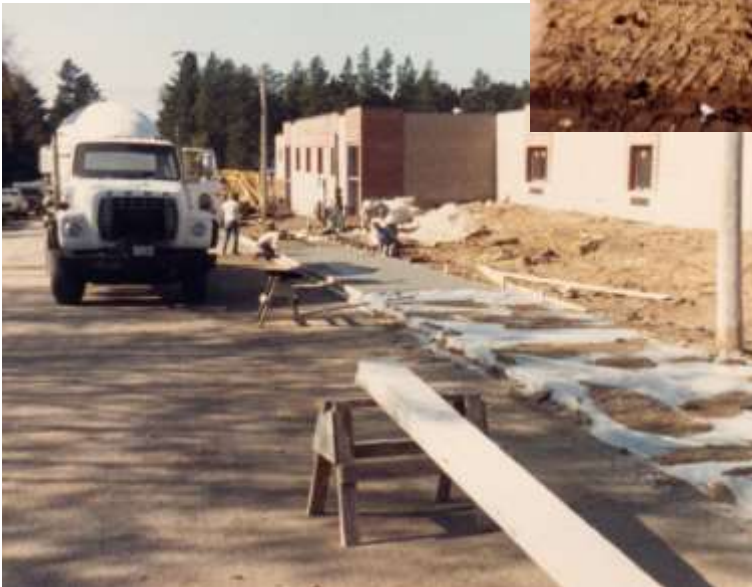
Pouring the sidewalk in front of the elementary wing.