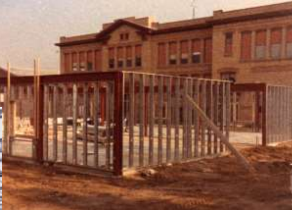
Top: Aerial photo of the new school construction.