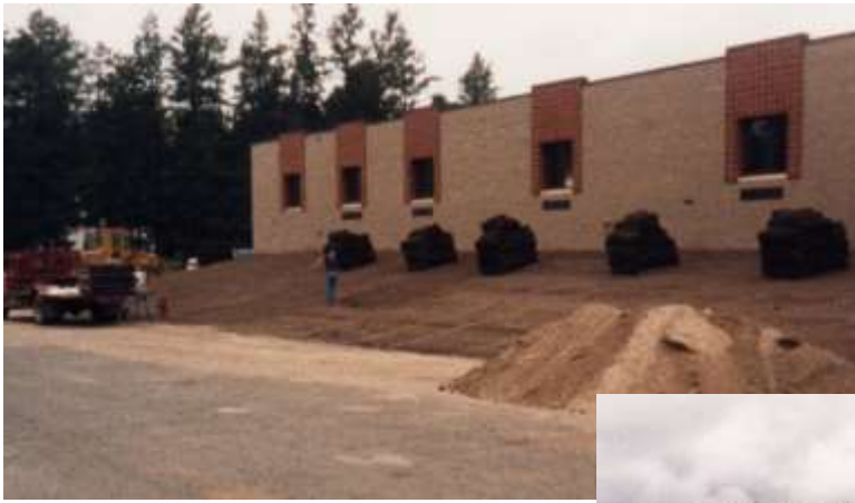
Sod rolls piled in preparation of finishing the landscaping.