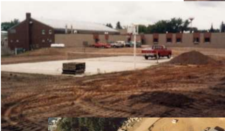
Left: North side of the high school wing, current location of Tiger Arena (built in 1994).