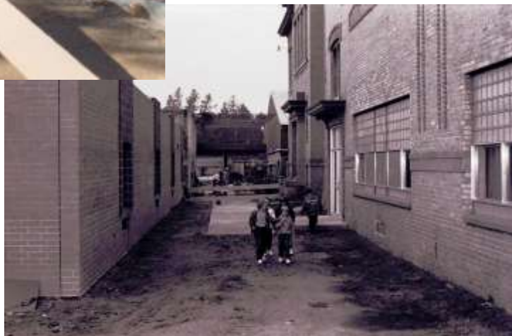
Students walking between the old and new school.