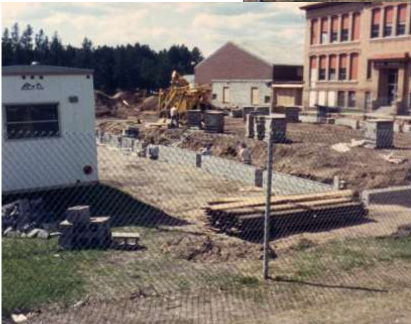
Construction on the new building.