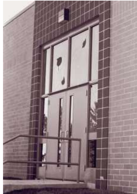
Vandalism to the west high school entrance.