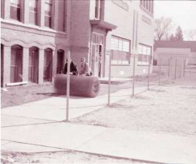
Fencing being put up in front of the old school to prevent students from entering the work zone.