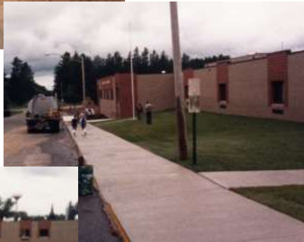
Front of the elementary wing after the landscaping was finished.