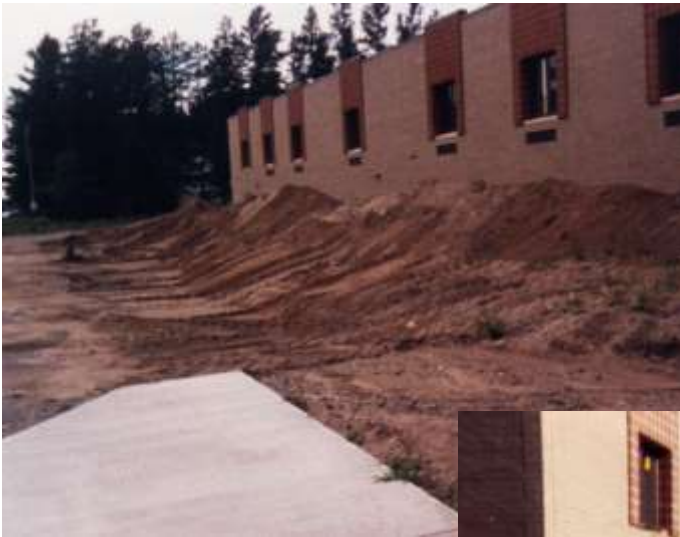
Working on the dirt work in front of the high school wing,