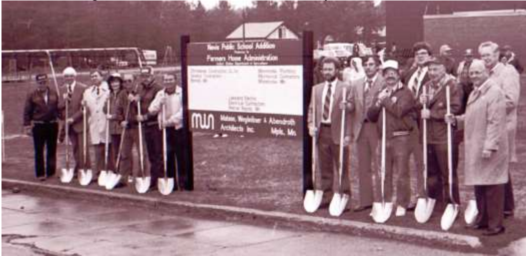
Ground Breaking Ceremony