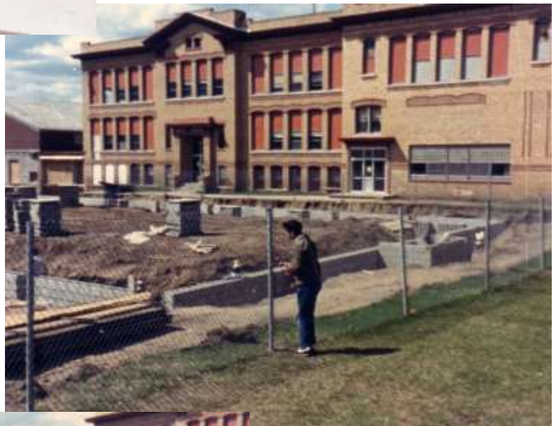
A view of the front of the old school and the work zone of the new school with the footings already in for the new building.