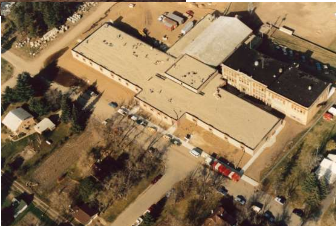
Below: Aerial view of the new building in relation to the old building.