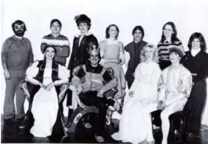
1980 First One Act Play Competition, "The Ugly Duckling"