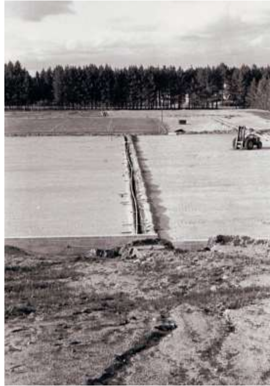
1980 Laying Sod on the Athletic Fields