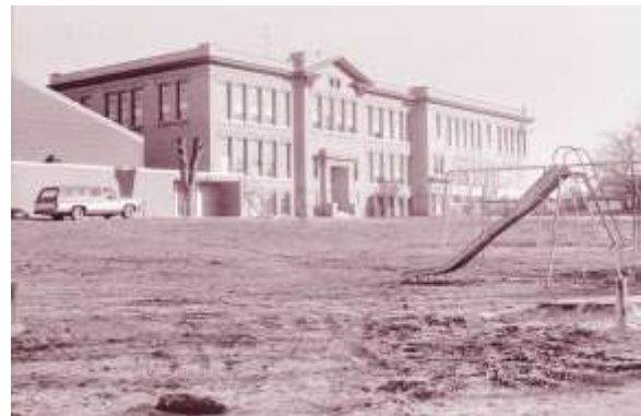
Front school yard after trees were logged