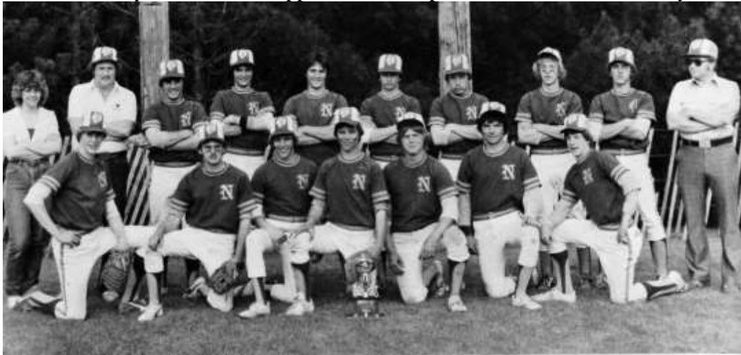
1980-1981 Baseball Team