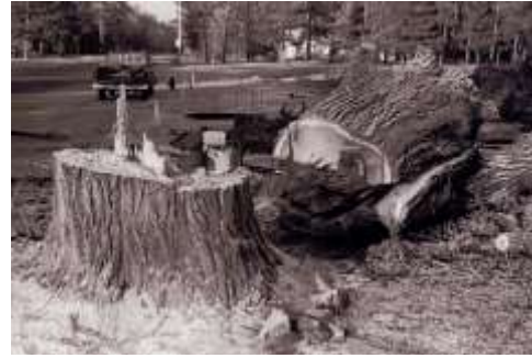
Logging the trees in front of the school building.