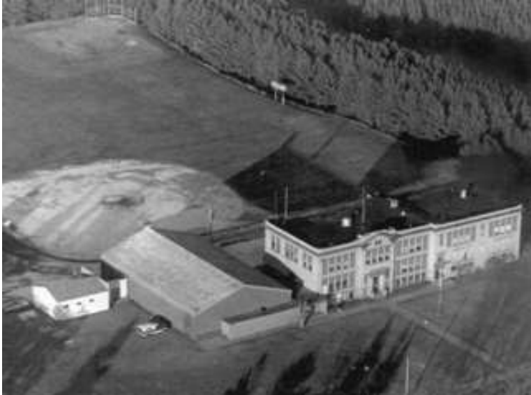
30 Aerial view of vis School