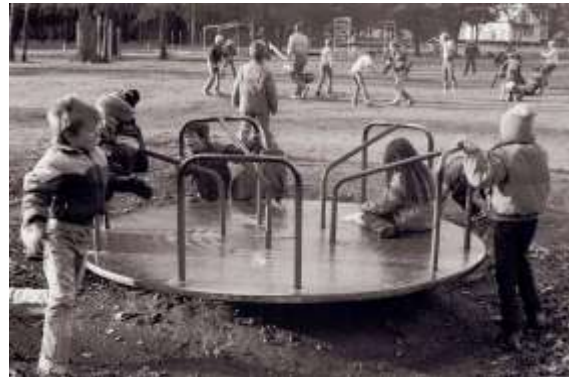
November Playground