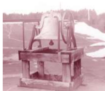
1912 Bell auctioned off in 1987