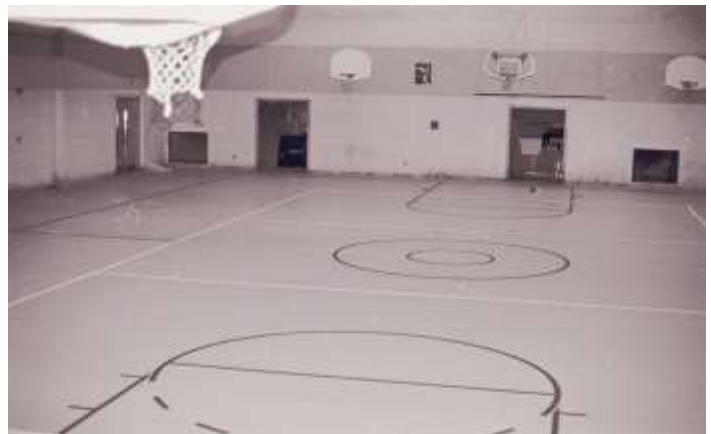
Left: New Gym Bleachers Above: New Gym Floor