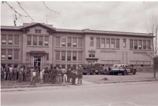
1980 Fire Drill at Nevis School