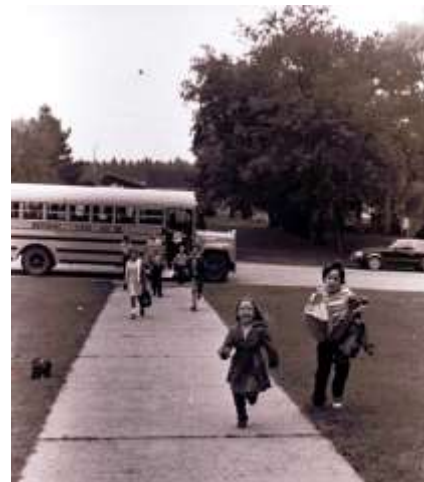
1980 Back to School