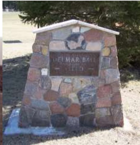
Above: Delmar Bail Monument