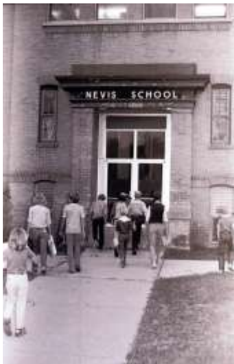
1980 Back to School