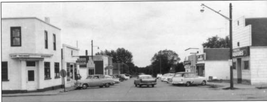
Main street in Nevis looking west.