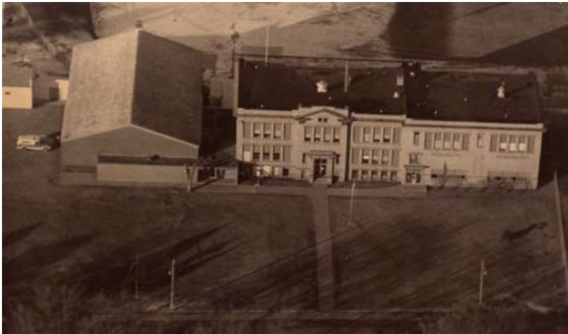
Aerial photo of Nevis School after the building of the “new gym”. The gym is the only part of the old school that remains today.

221 yes 48 no 1 spoiled vote 270 total ballots