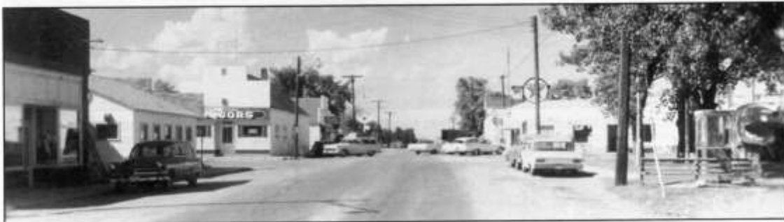
Muskie Park (right) made Nevis a popular place to visit. This view looks north on Paul Bunyan Drive.