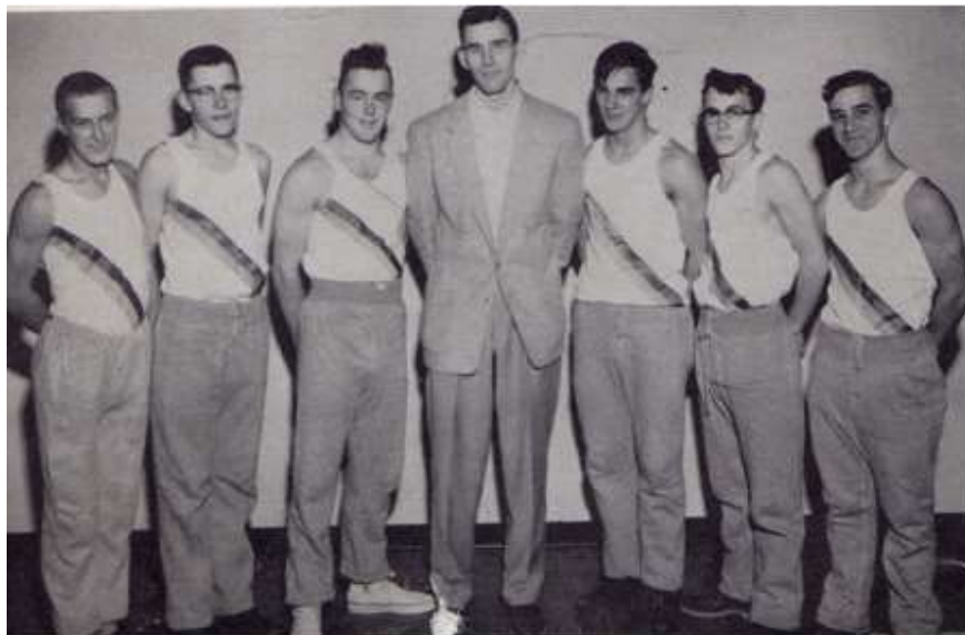
1955-1956 Track Team