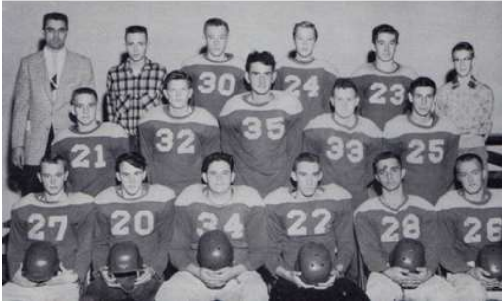
1956-1957 8-man football started