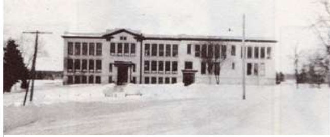
Nevis School in Winter 1947