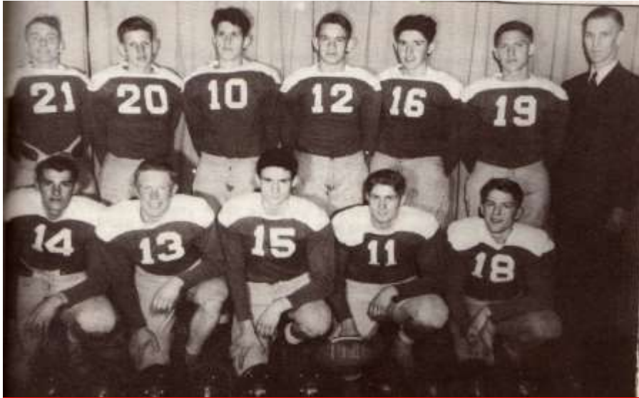
1946-1947 6-man football started