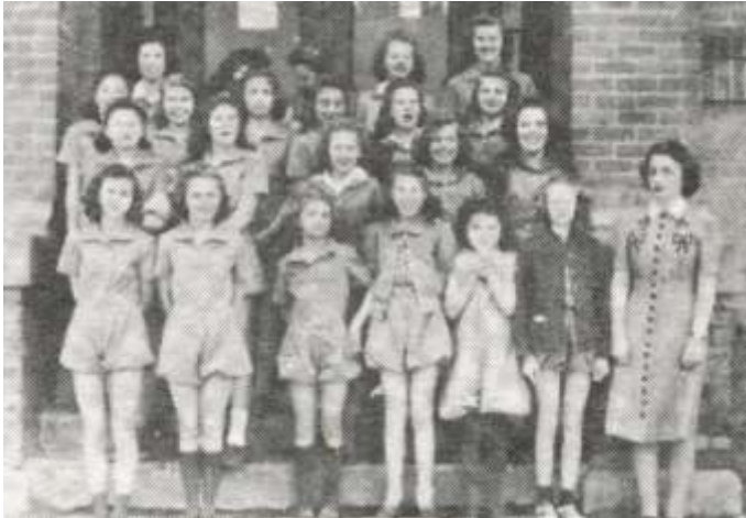
1941-1942 girls' gym clothes made by WPA workers.