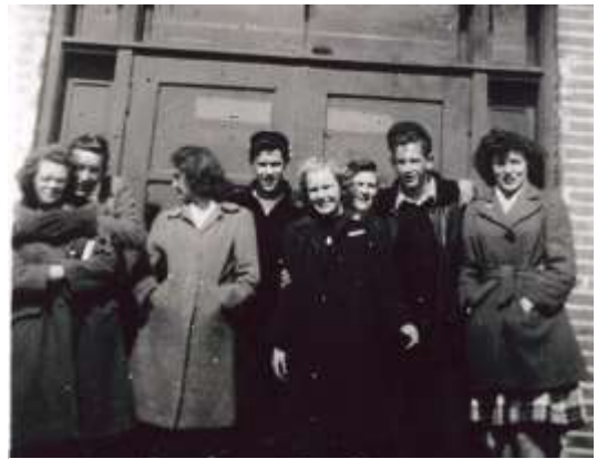
Class of 1946