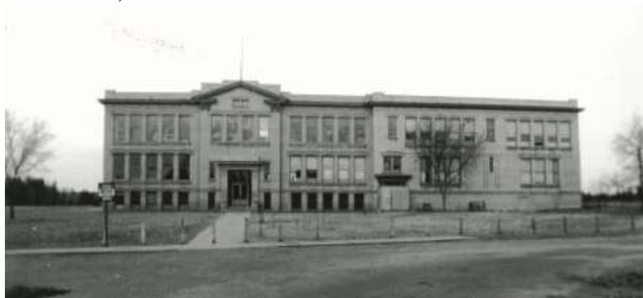
1940s Nevis School building, WPA sign in the front of the building.