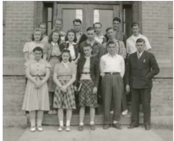
Class of 1940