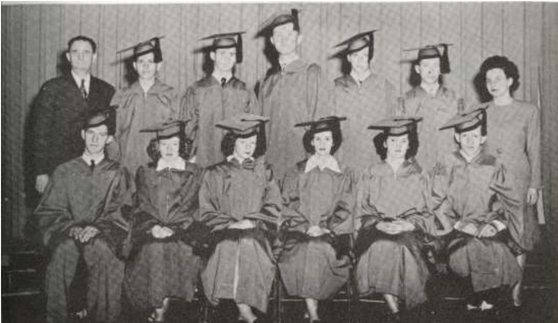
Class of 1948