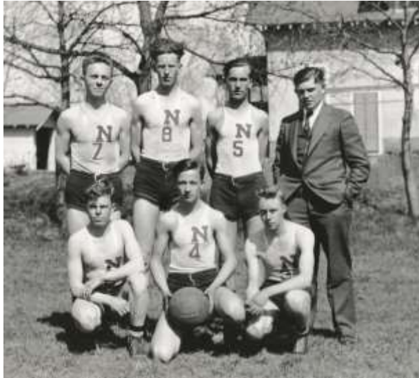
1935-1936 Boys Basketball Team