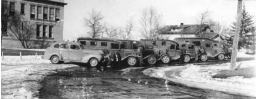
Spring time and school buses