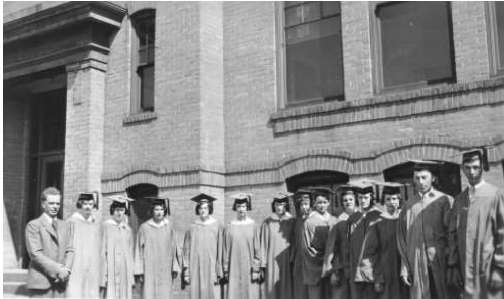
Class of 1931