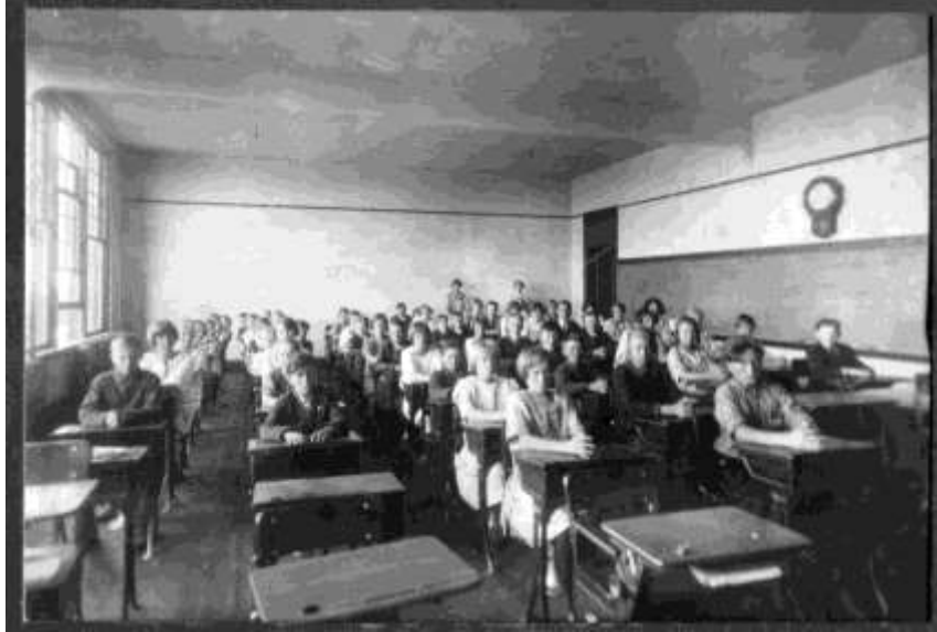
1930s picture