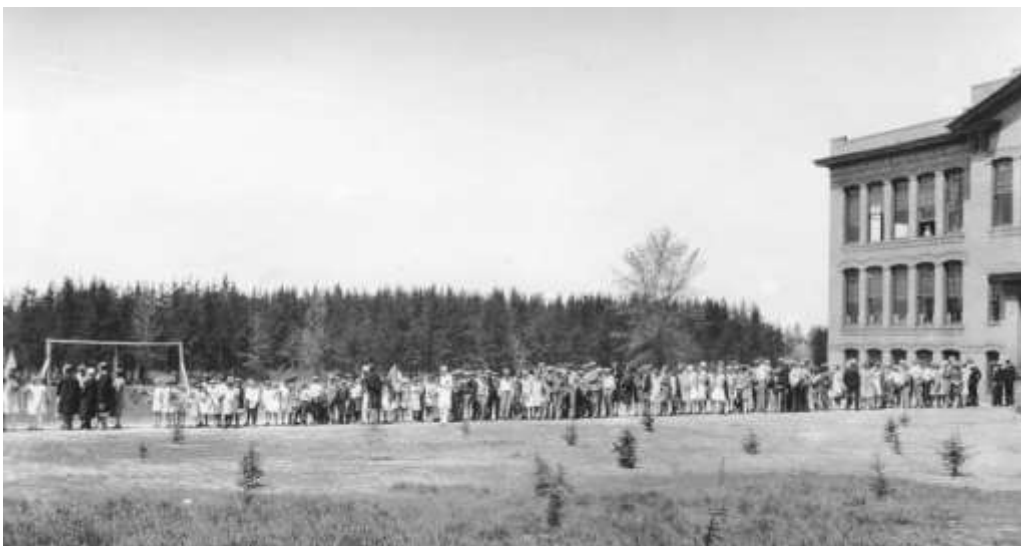
1930s school activity on the front lawn