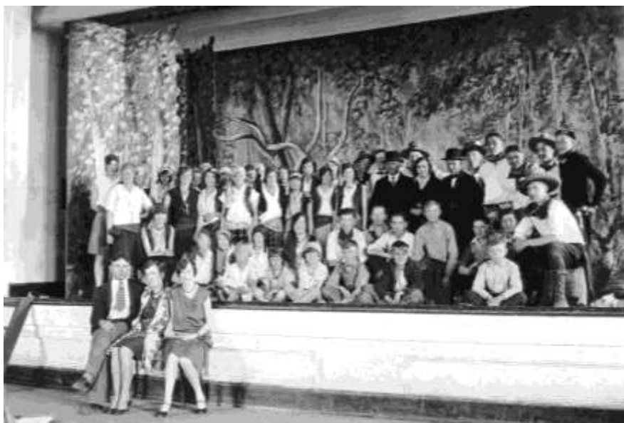
May 16, 1930 School Play – Gypsy Rover Operetta