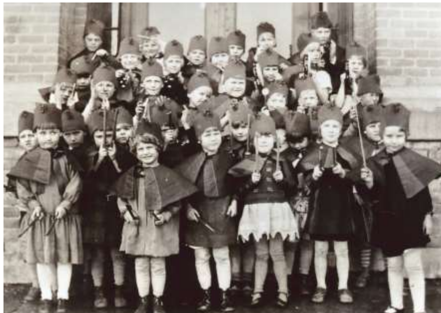
1931-1932 1 st and 2 nd grade Rhythm Band