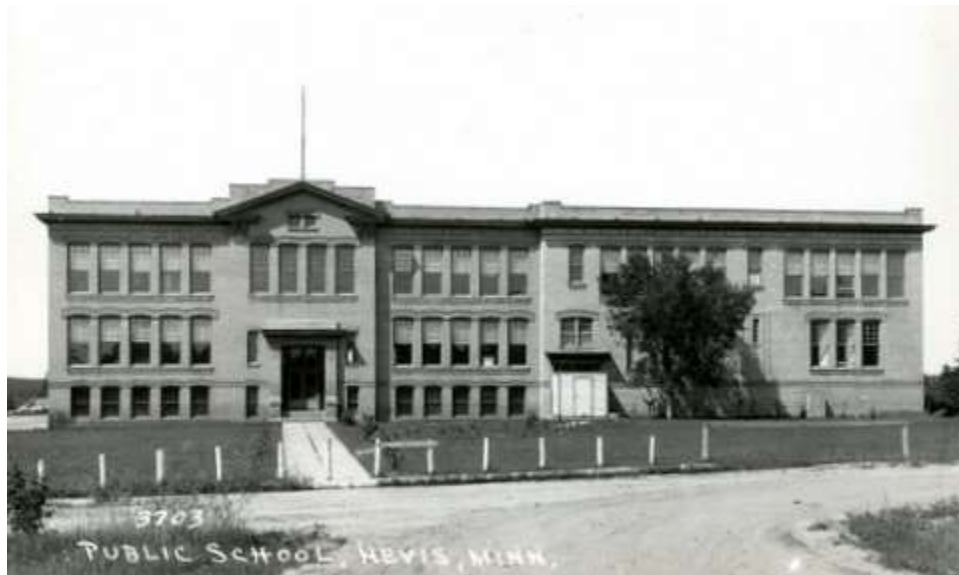
1930s picture of Nevis School